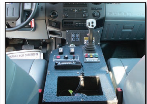
Custom Electrical Consoles