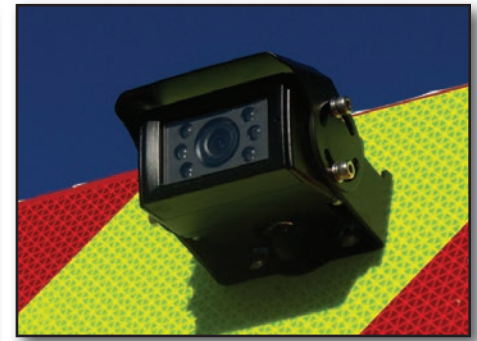
Rear Back-Up Camera