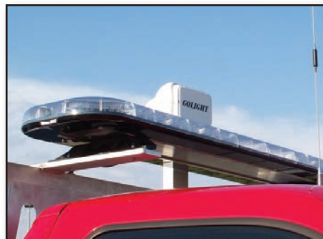
Golight Search Light