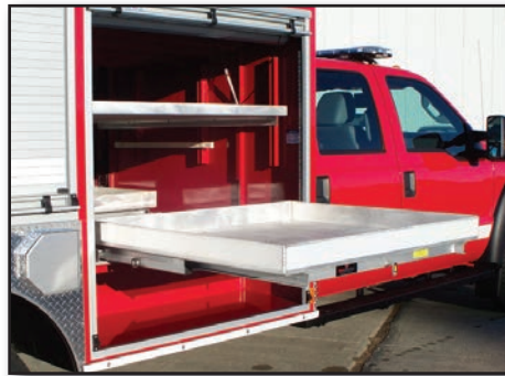
Roll Out Trays