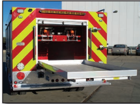
Rear Hydraulic Reels