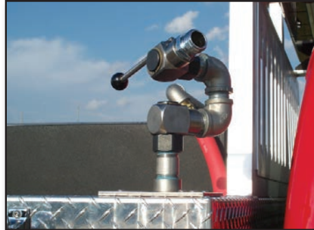
Small Deck Guns