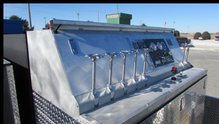
Top Mounted Controls