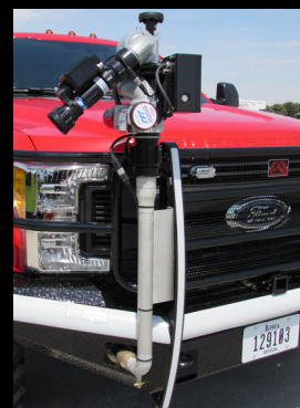
Front Bumper Turrets