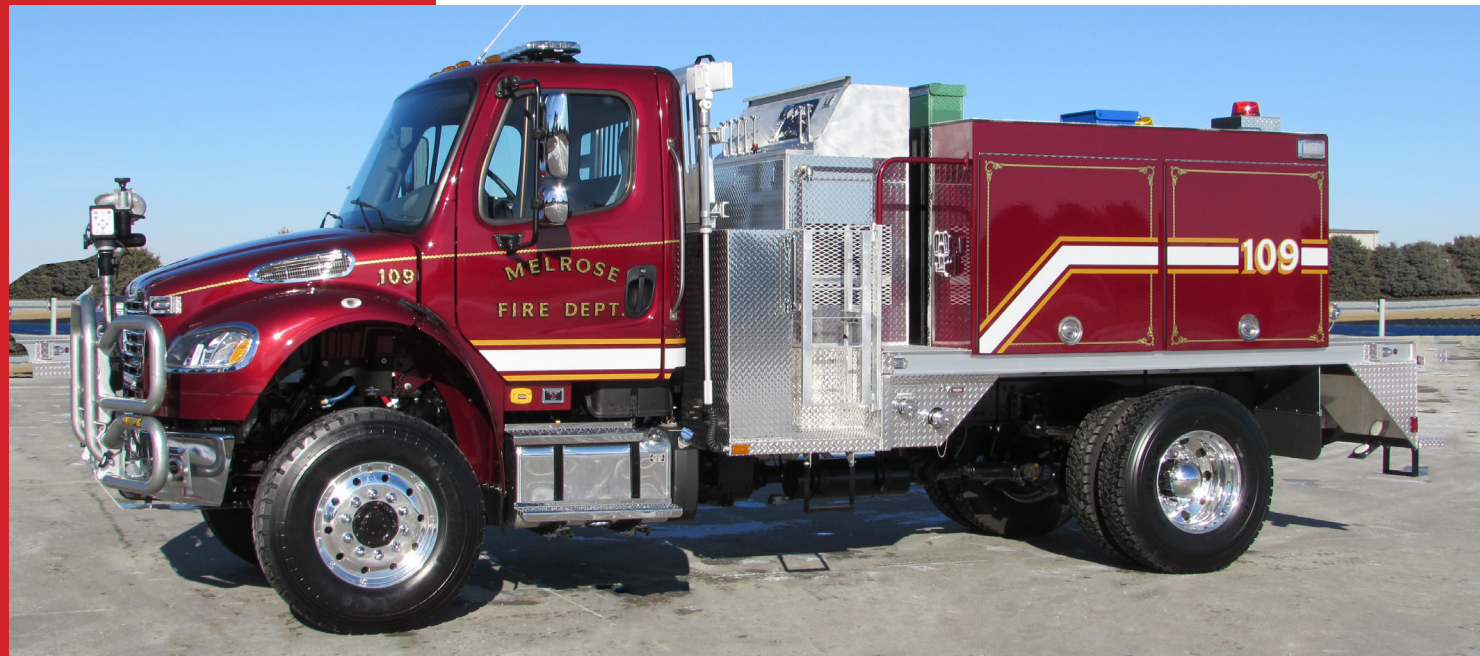
1,000 Gallons Water