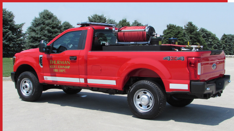
Pickup Mounted Skid