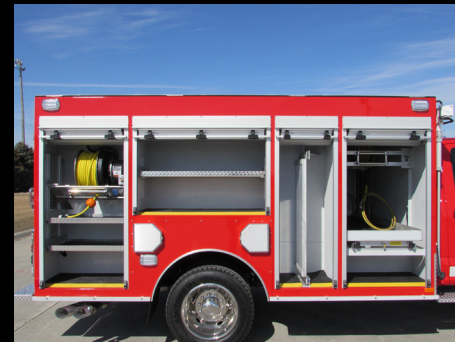
Maximized Compartment Space