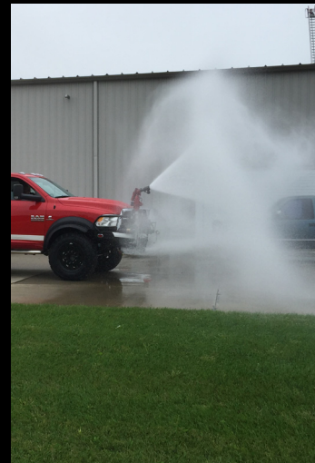
Ground Sweeps and Turret in action