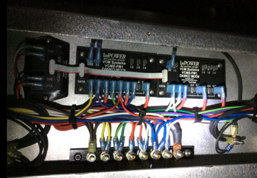
Multiplexed Wiring System