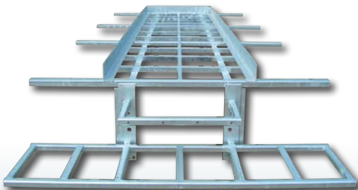
Galvanized Tank Cradle (Lifetime Warranty)