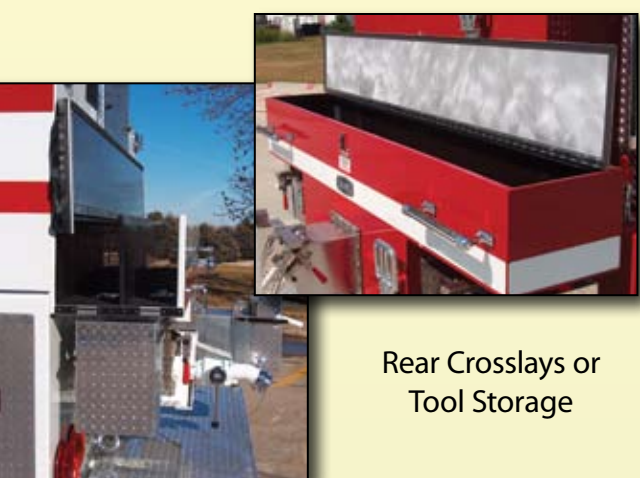
Rear Crosslays or Tool Storage