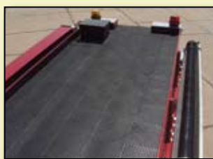
Top of Tank Storage