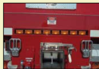
Traffic Directional Light