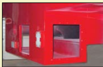
Rear 3-Way Manifold